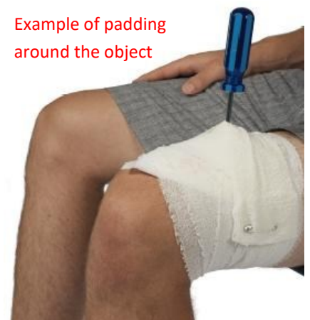
Example of padding around the object