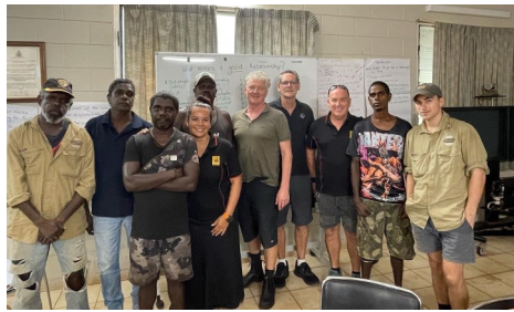
The Men's Shed had participants attend the 'Be The Best You Can Be' workshop facilitated by Mibbinbah Spirit Healing.